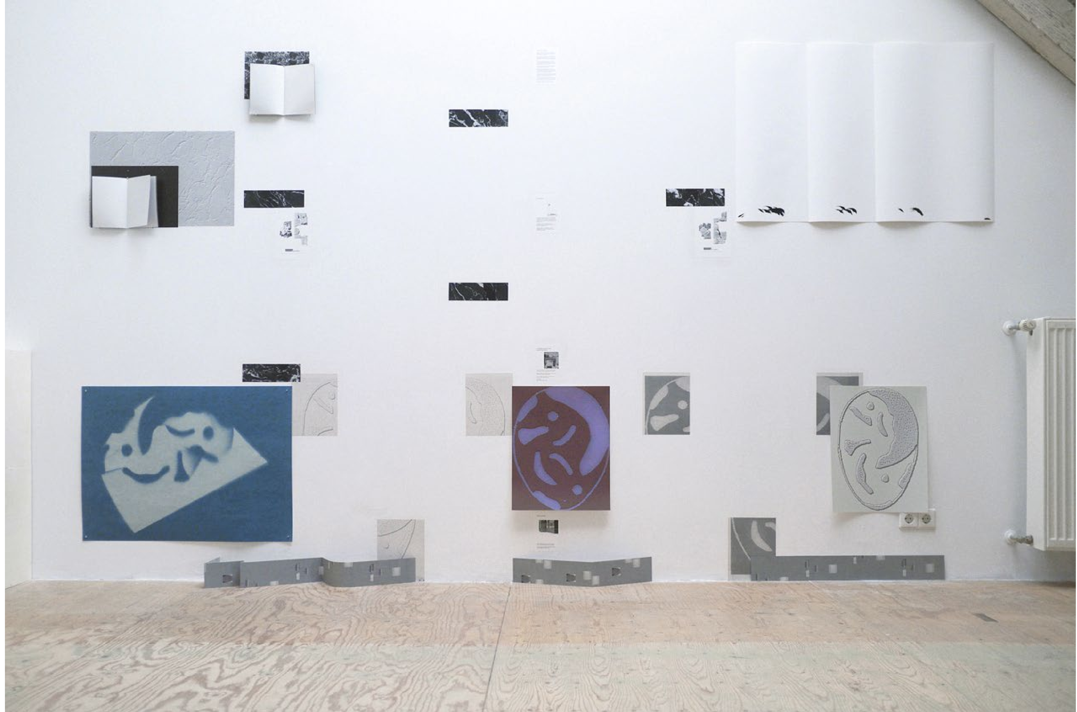
Manifold Books No.1: Maartje Fliervoet. Overview of Intervall, Grund . 2015. Size variable. Aluminum, piézographies, laser prints, digital prints, offset printed artist publication.