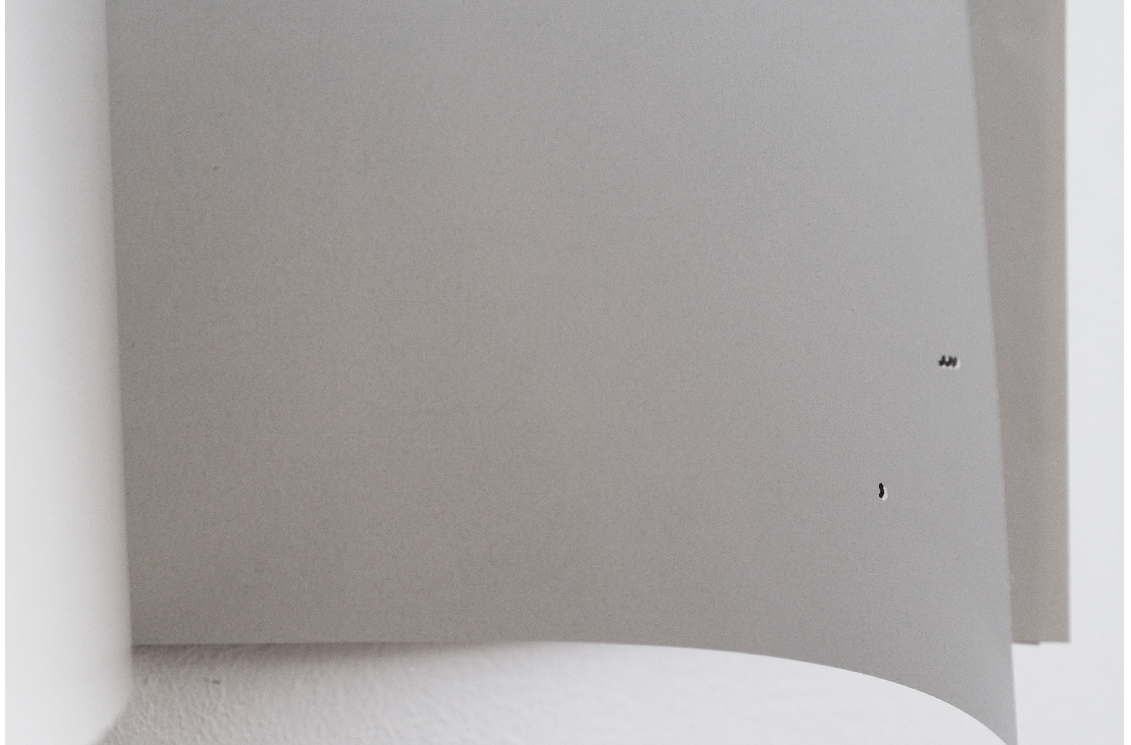
Manifold Books No.1: Maartje Fliervoet. Detail of Intervall, Grund . 2015. Size variable. Aluminum, piézographies, laser prints, digital prints, offset printed artist publication.