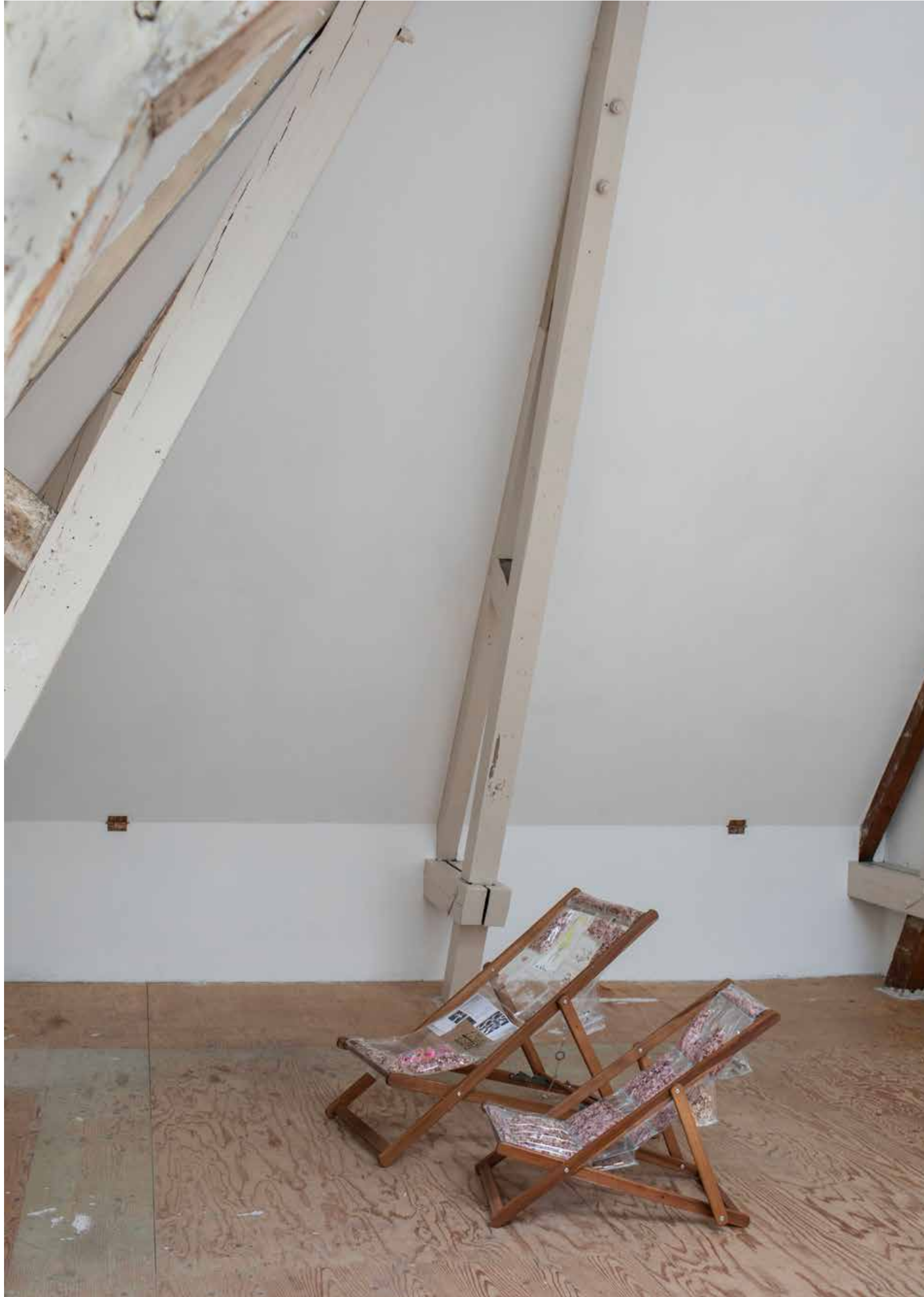
15. Overview Slow Swoon .