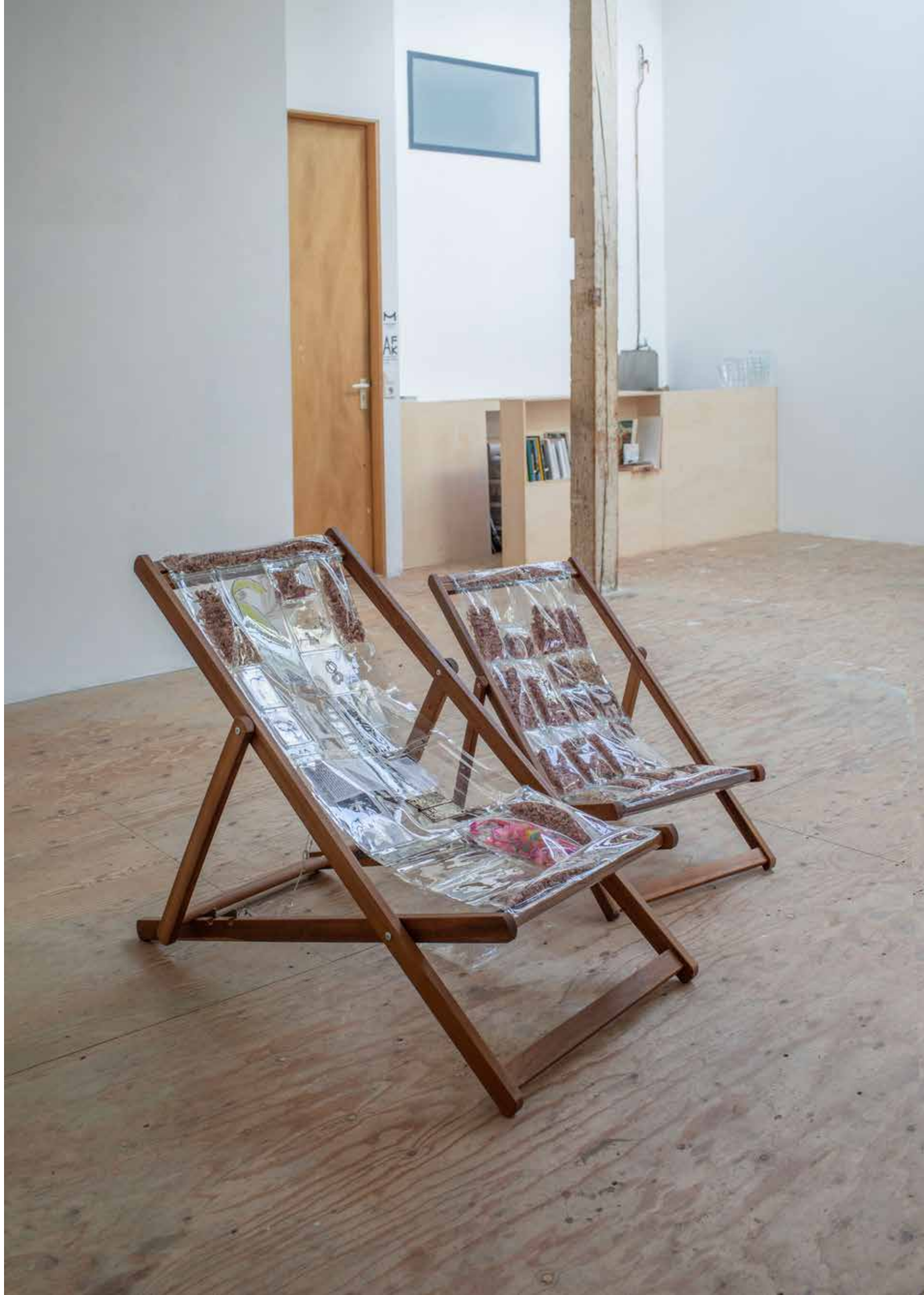
04. Overview Slow swoon .