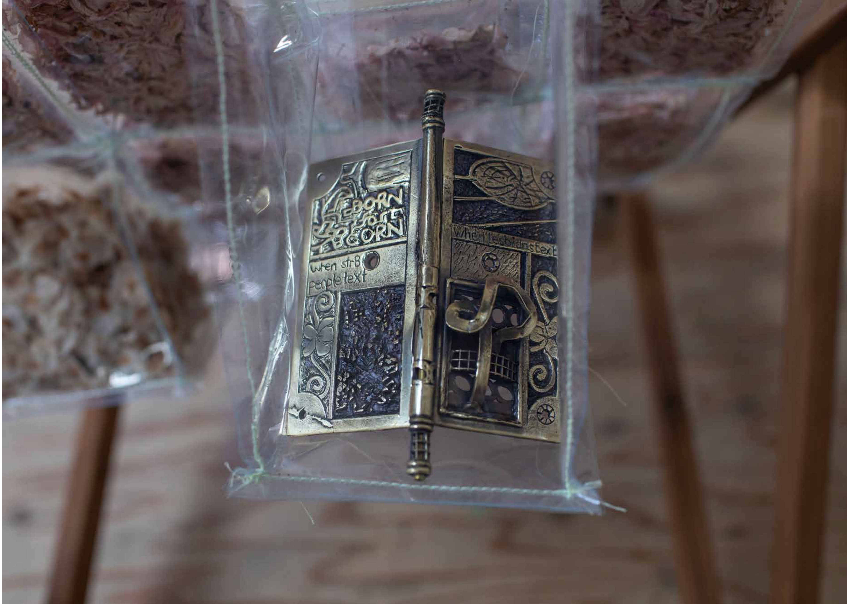
07. Close up: Clem Edwards, Little Chair , 2025; When Straight People Text (hinge), 2025.