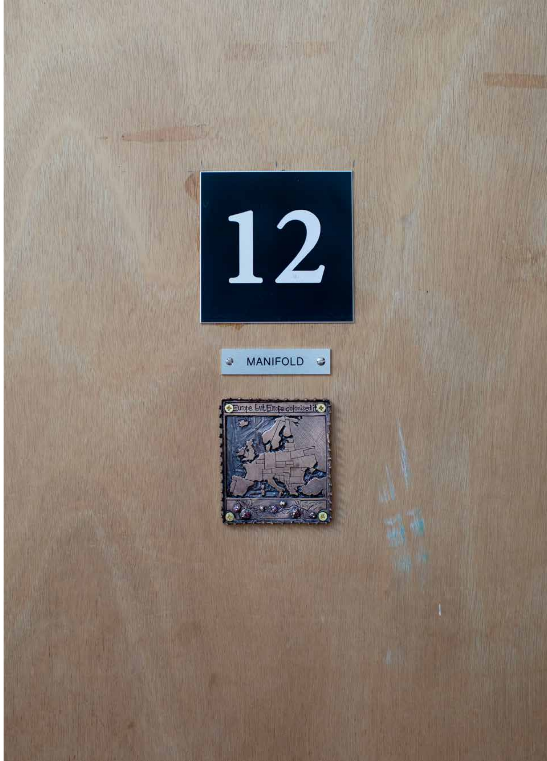
01. Clem Edwards, Europe but Europe Colonised it (doorplate), 2025.