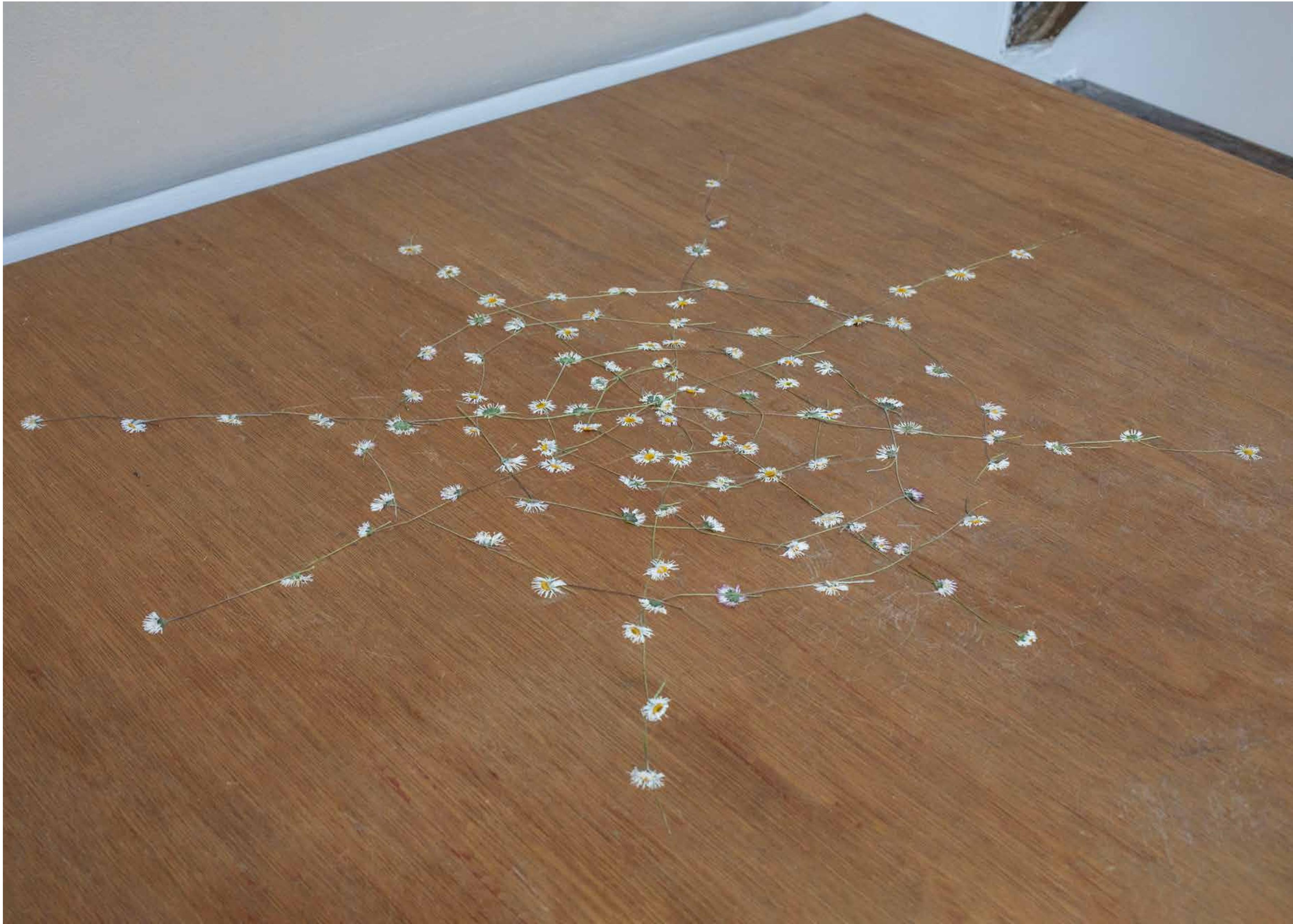
14. Clem Edwards, Daisy Chain Spiderweb , 2025.