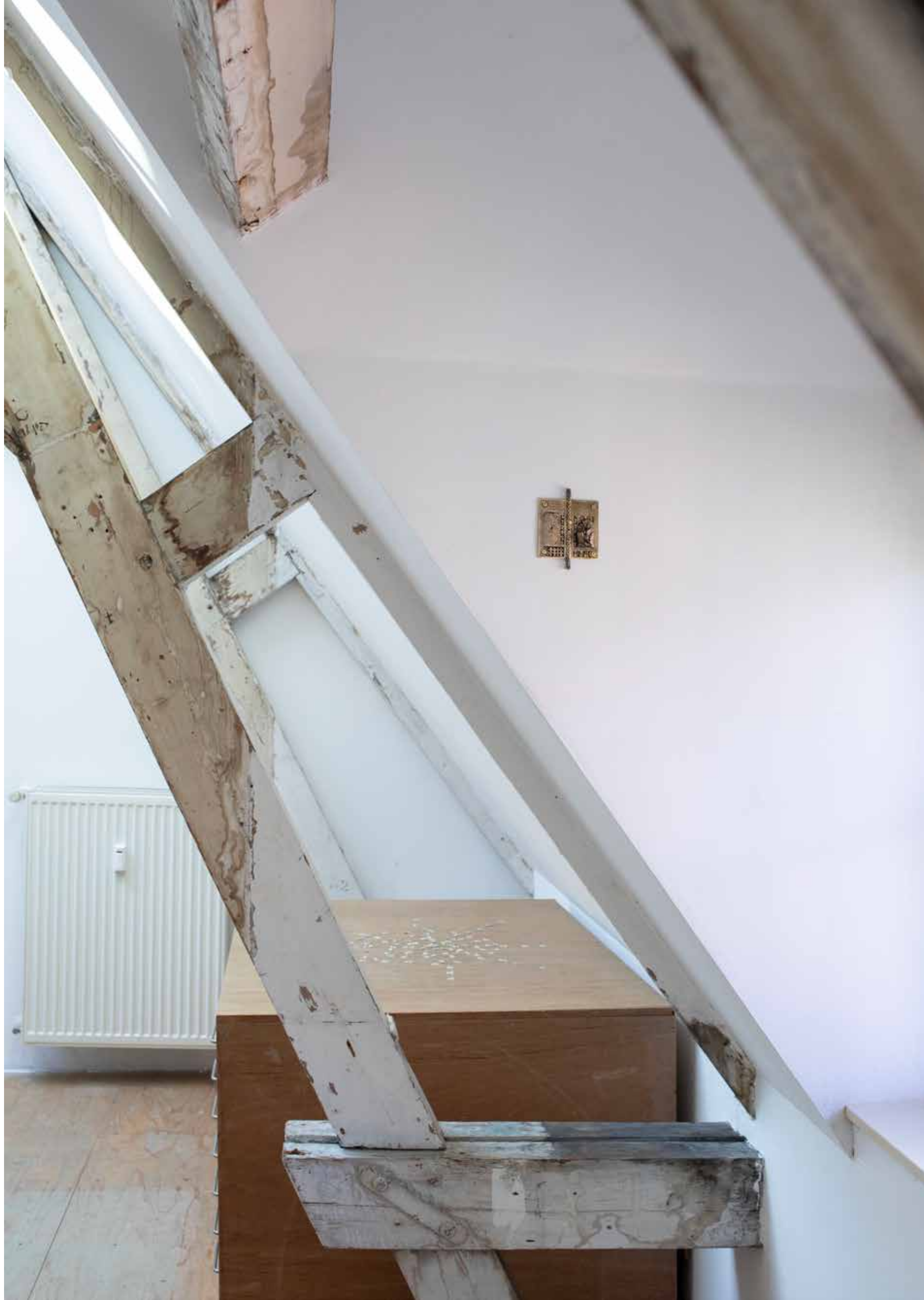
12. Overview Slow Swoon .