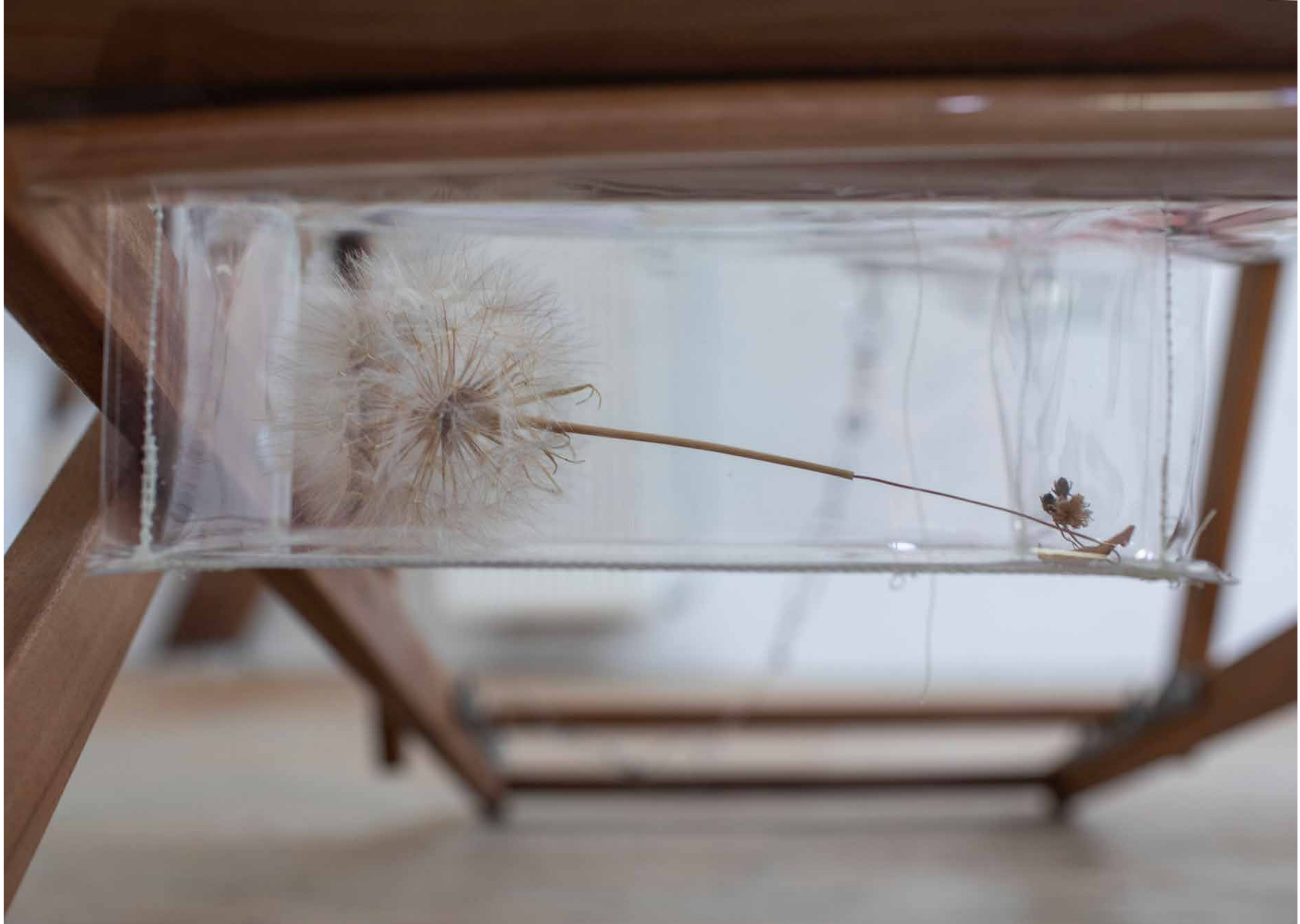
10. Close up: Clem Edwards, Big Chair , 2025.