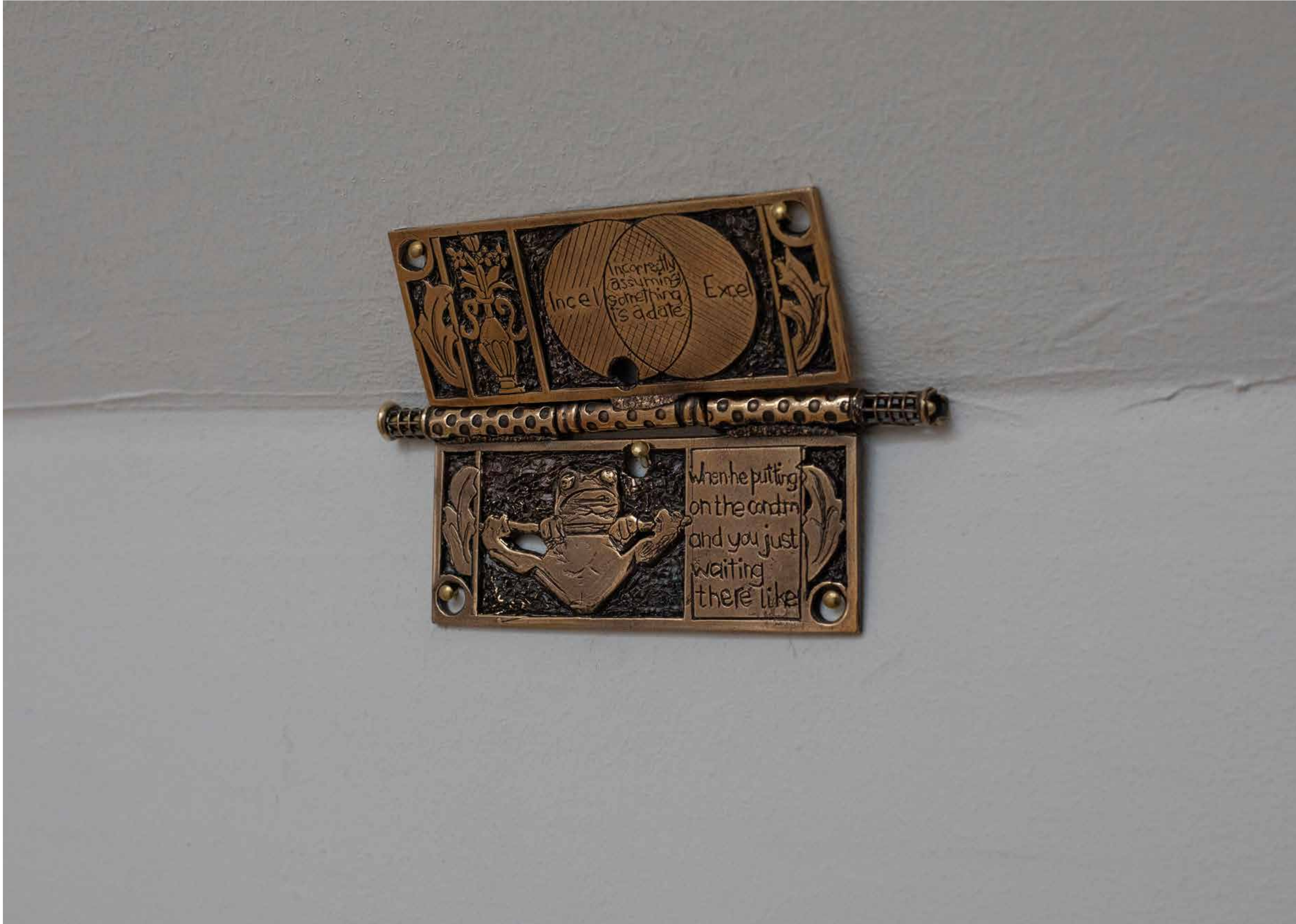
16. Clem Edwards, Incel/Excel (hinge), 2025.