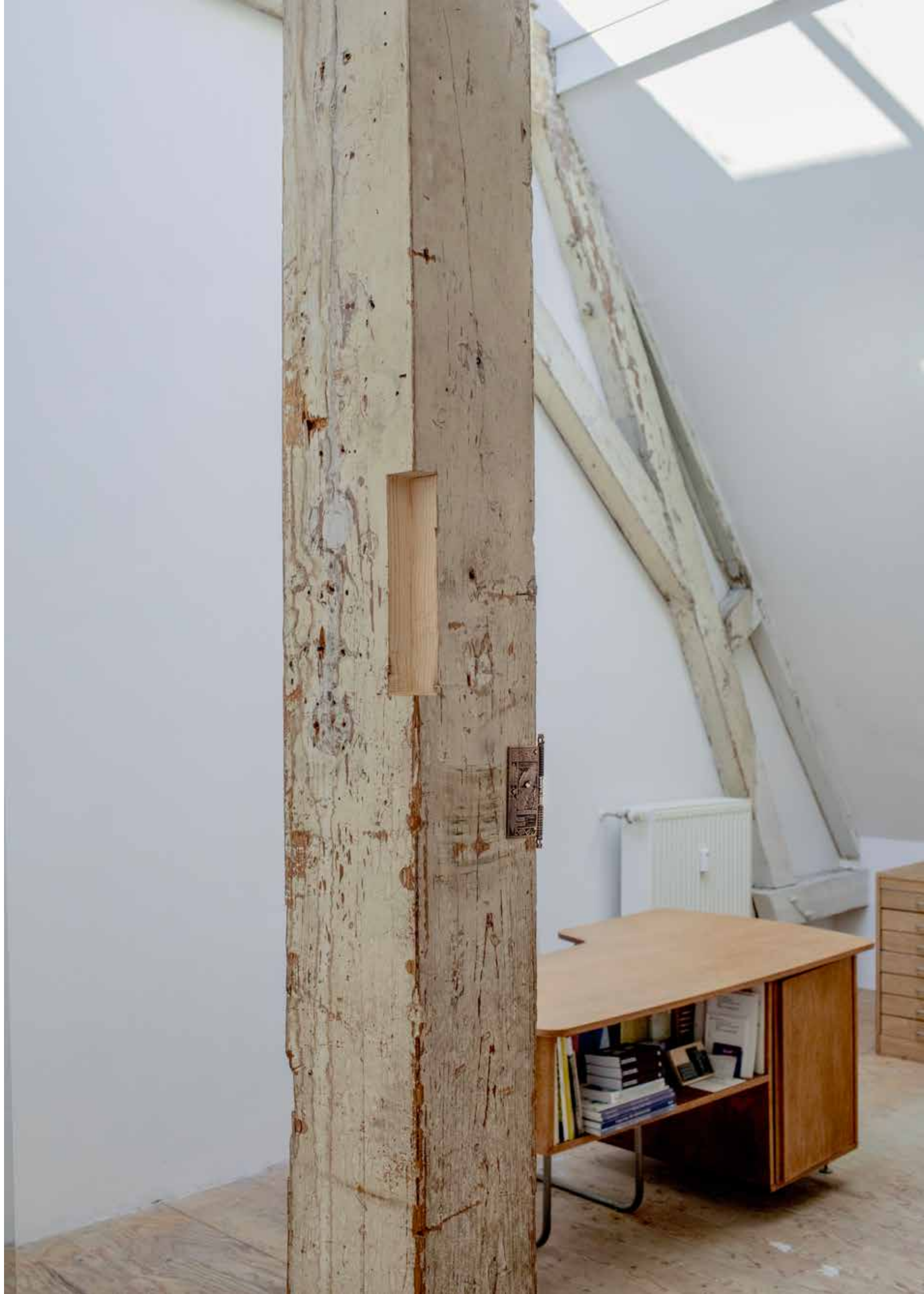
02. Overview Slow swoon .