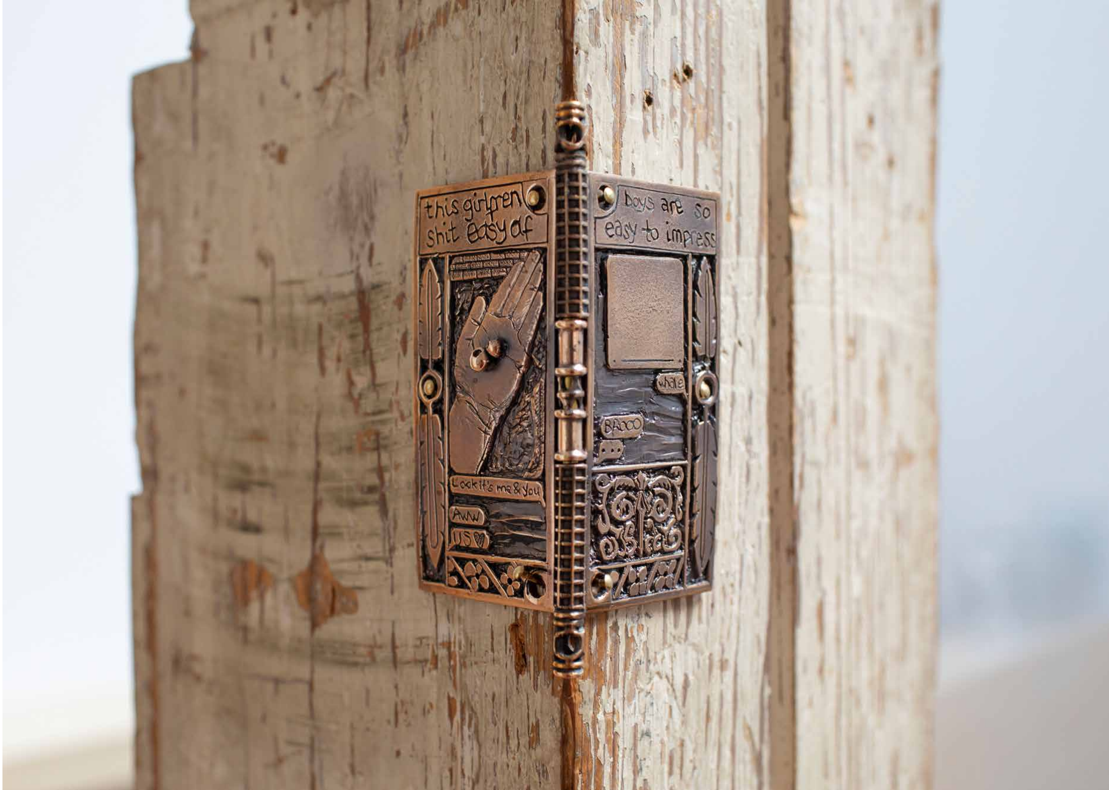
03. Clem Edwards, Boys are So Easy to Impress (hinge), 2025.