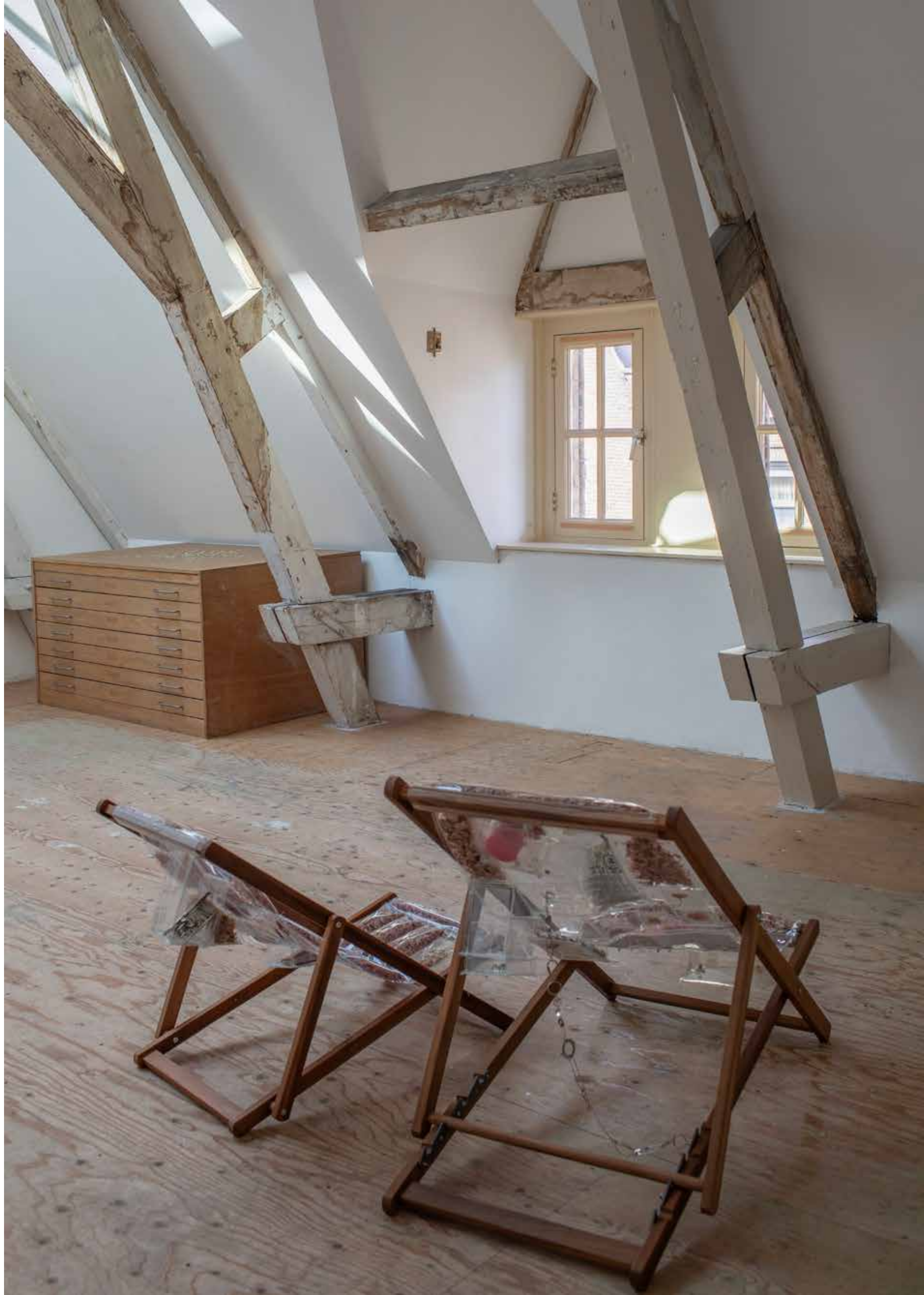
11. Overview Slow Swoon .